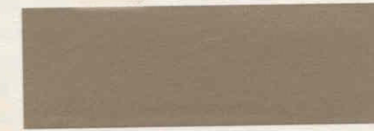
H ALASKAN GOLD IRID.