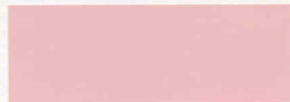
G TALISMAN RED