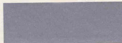
Q LILAC IRID.