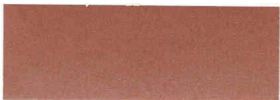
U* COPPER IRIDESCENT