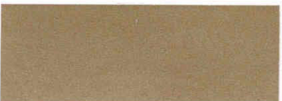
X* GOLD IRIDESCENT