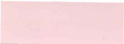
T CHALK PINK