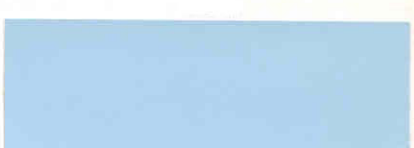
F POWDER BLUE

*Used on Corsair and Citation models only