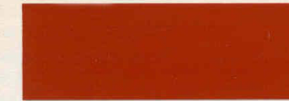
J REGAL RED