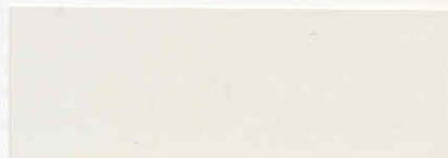
E SNOW WHITE