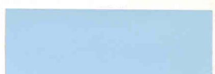
F POWDER BLUE

*Used on Corsair and Citation models only