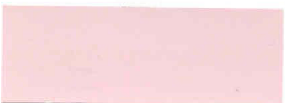
T CHALK PINK