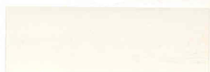
E* FROST WHITE