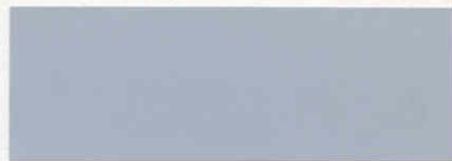
B MOONRISE GRAY