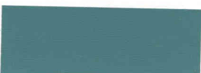
K SPRING GREEN