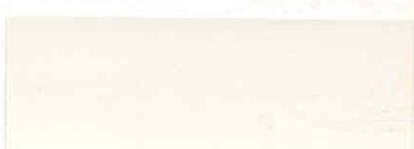
E* FROST WHITE