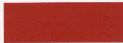
F PRESIDENT RED