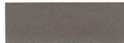
B SILVER GRAY IRIDESCENT