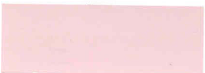
T CHALK PINK