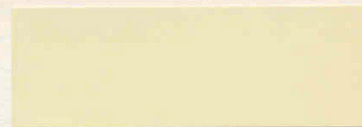
R BUTTERCUP YELLOW