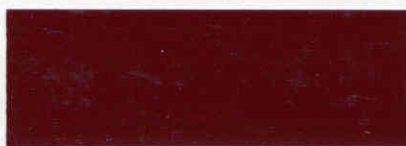
J VELVET MAROON