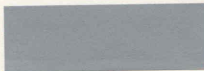
Z CLOUD SILVER IRID.