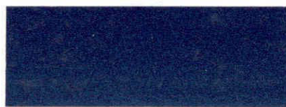
H ROYAL BLUE IRIDESCENT