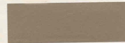
H ALASKAN GOLD IRID.