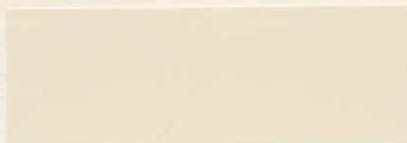
M POLAR WHITE