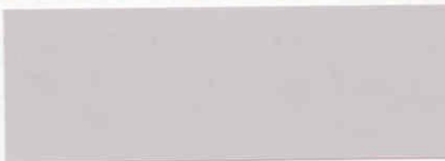
H DESERT TAN