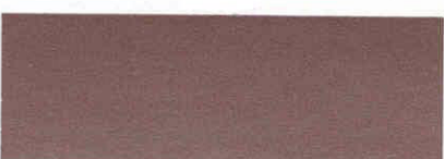
M CHARCOAL BROWN IRIDESCENT