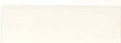
E* FROST WHITE