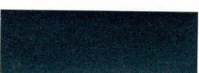
L SPRUCE GREEN IRIDESCENT