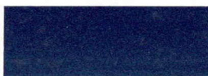
H ROYAL BLUE IRIDESCENT