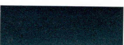
L SPRUCE GREEN IRIDESCENT