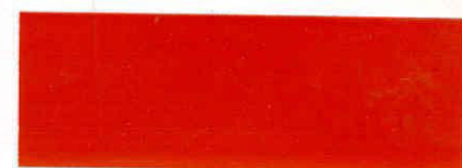
C EMBER RED