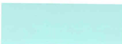
J ICE GREEN