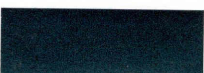
L SPRUCE GREEN IRIDESCENT