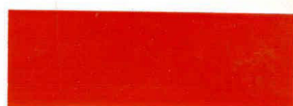
C EMBER RED