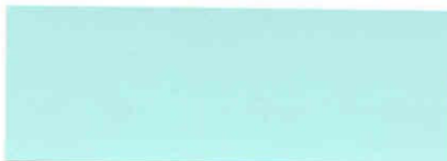
J ICE GREEN