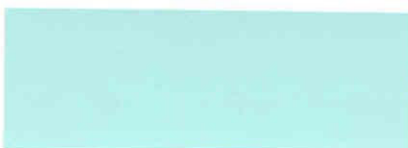
J ICE GREEN