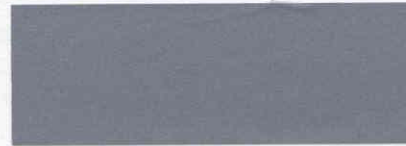
K PLATINUM GRAY IRIDESCENT