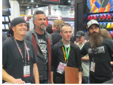
Gas Monkey Garage stars pose with a fan.